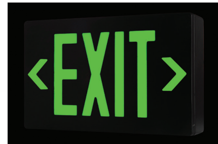
Sign in the dark