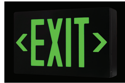
Sign in the dark