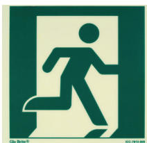
RMR Emergency Exit Straight or Right 8" x 8"