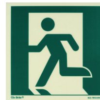
RML Emergency Exit Straight or Left 8" x 8"