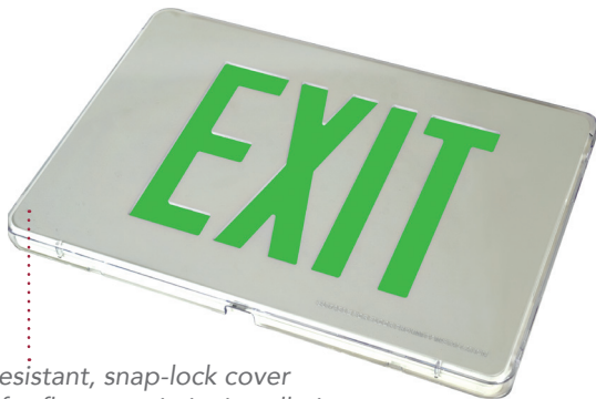
Vandal-resistant, snap-lock cover suitable for floor proximity installation. (Remote Unit shown below)

Combine all the features of the Razor MK 3 Classic with the powerful ability to interface with another Razor via Remote, and voilà – you get the Razor MK 3 Master - Remote. This is an ideal solution that allows the high-level Master Razor to power a low voltage low-level or remote exit sign.