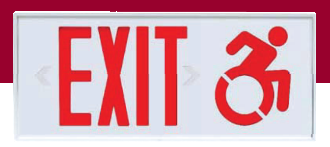
Meets the requirements of the State of Connecticut Building Code Para. 1011.1.2